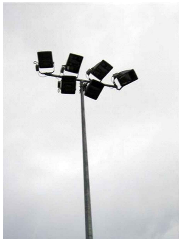
TYPICAL FLOODLIGHTING LAMPS