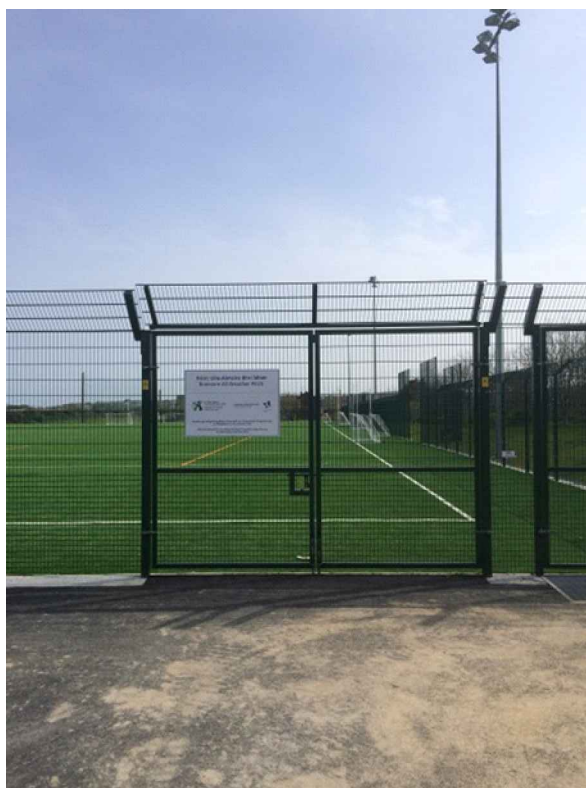
TYPICAL ALL WEATHER PITCH & FENCE