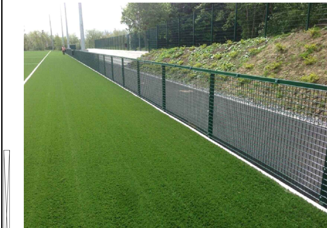
TYPICAL 1.2m HIGH SPECTATOR FENCING