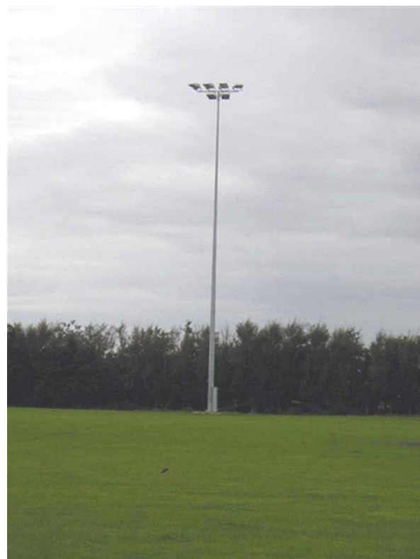
TYPICAL FLOODLIGHTING MAST