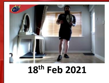
18 th Feb 2021