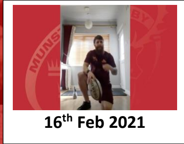
16 th Feb 2021